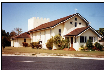
St. Mark's Woody Point