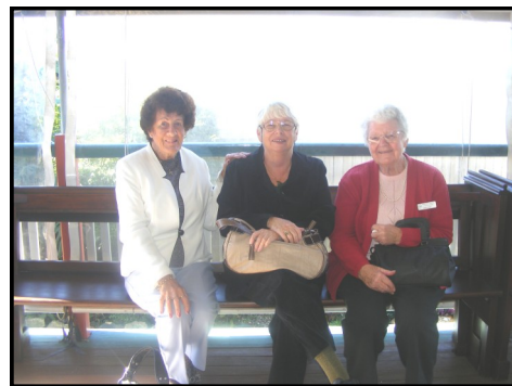
The Three Musketeers