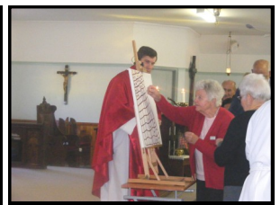
Putting on Smiley Faces