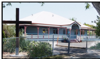
ST PETER THE FISHERMAN