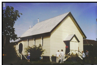
St. Barnabas' Clontarf