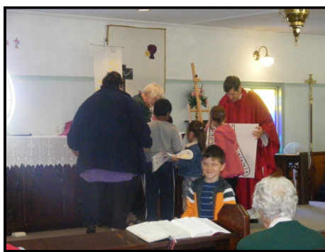
Kids Club putting smiley faces on net